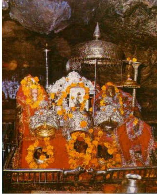
Vaiṣṇo devī in Kashmir