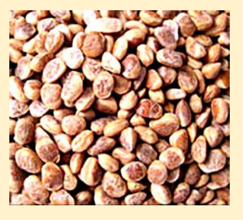
Pilu-fruits and Piyal-nuts

16.4-5 One line added at the end: Thus it will become suitable for decorating a great person." (Added September 14, 2011)